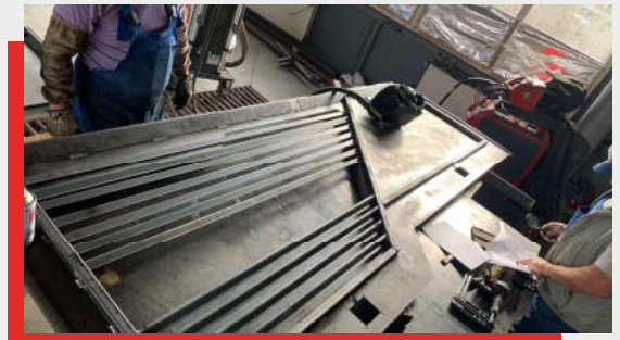
FIT-UP & FIXTURE WELDING