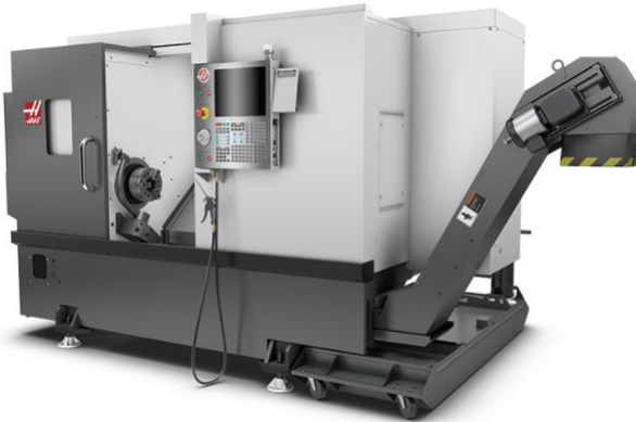
4. HAAS ST20Y CNC lathe with bar feeder: Ø200x700 mm