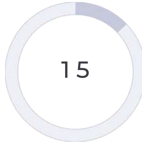
Years Strategic Supplier Agreement